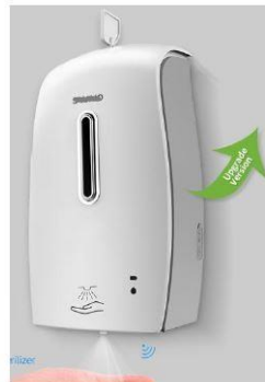
Automatic hand sanitizer dispenser (Spray type)

Packing: 12pcs/Carton N.W.: 13.60kgs G.W.: 16.30kgs Carton: 515*500*308MM 20ft: 4236pcs 40ft: 8772pcs