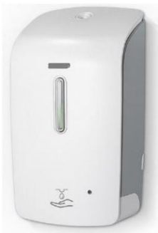
Automatic hand sanitizer dispenser (Gel type)

#2 Rated (4.56 out of 5) 1000 ml...compared to higher rated model